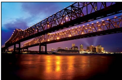
Cityscape at Night

The SSA Board of Directors recently spent time reviewing ways to cut convention expenses for SSA Members, while at the same time, as an association, still being able to present a fun and educational convention.