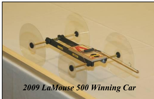
2009 LaMouse 500 Winning Car

It is time to take part in the fun! The past two years SSA has held the LaMouse 500 to great response with crowds gathering around the track to cheer